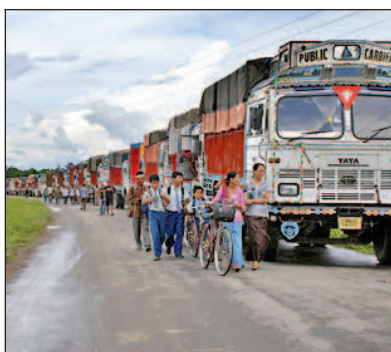
Schoolchildren walk past empty trucks parked waiting to be escorted by police to neighboring Assam to ferry supplies to Manipur

They said it was time the rest of India acted to support the people of Manipur through this crisis. "They need support from everyone to put an end to the sufferings and help them live a normal life," the letter said. The sports stars also hoped the Prime Minister's December 3 visit would "sow the seeds of peace and lay the foundation of a prosperous Manipur". The unusual appeal was organized