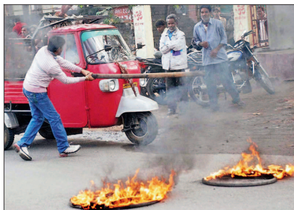
A protester attacks a goods carrier during a bandh in Jamshedpur

Several states, including Uttar Pradesh, Tamil Nadu, West Bengal, Gujarat and Bihar have made it clear that they will not permit global retail chains, who can now own up to 51% stake in Indian