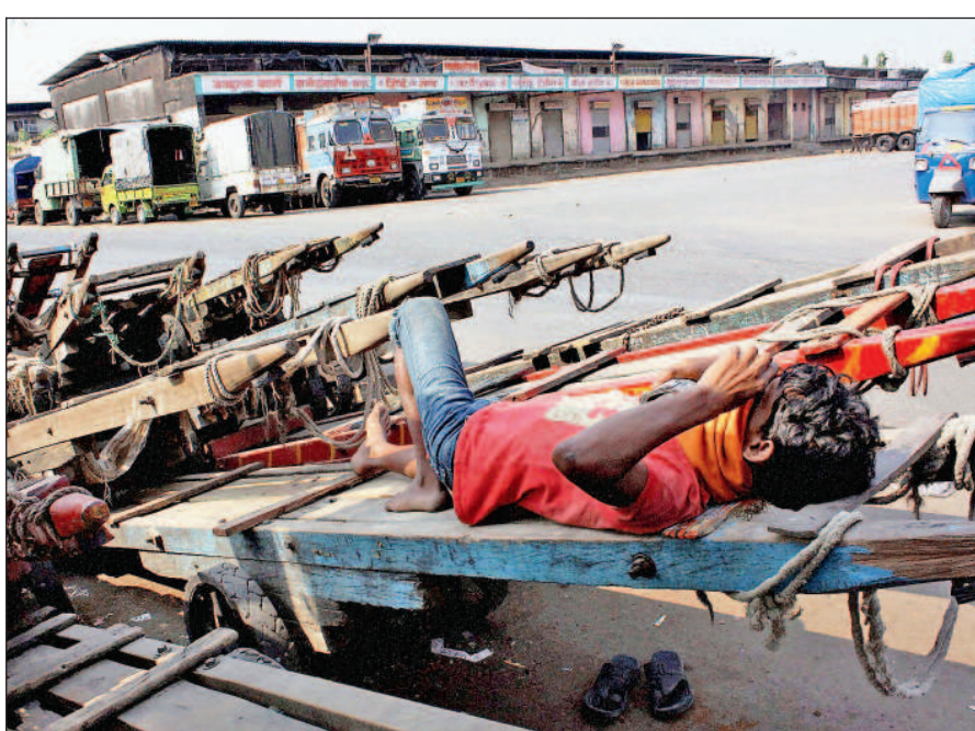
A labourer in Navi Mumbai rests during the nationwide bandh against FDI in retail on Thursday

Although most political parties, including the Left, and trade unions in West Bengal supported the one-