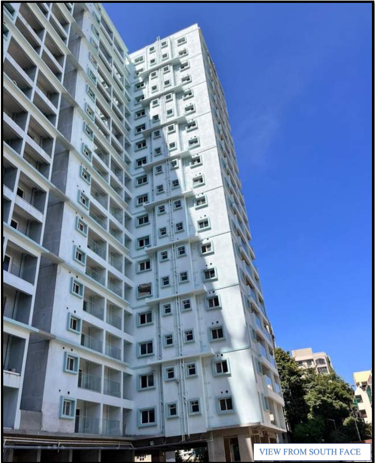
VIEW FROM SOUTH FACE