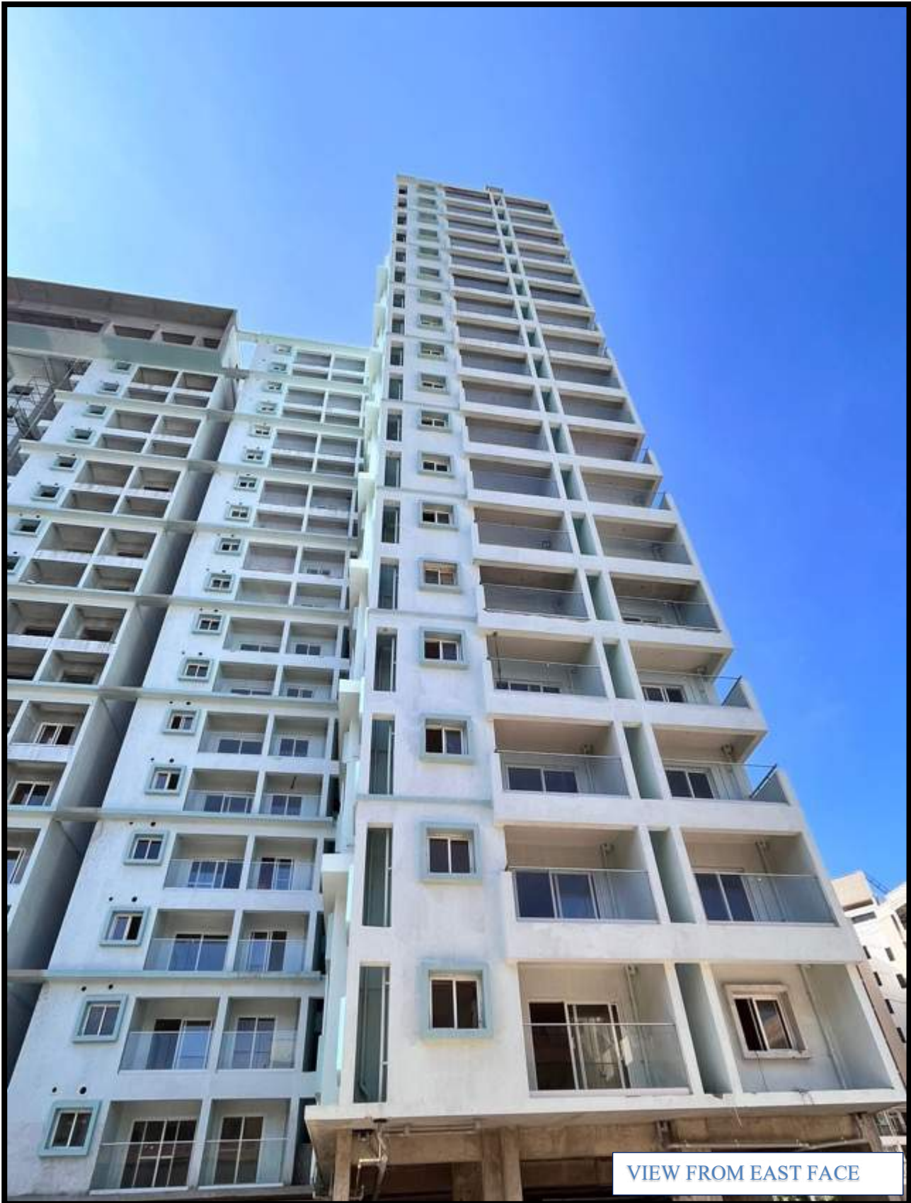
VIEW FROM EAST FACE