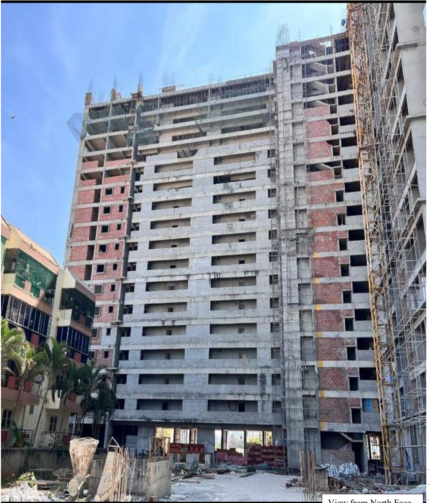
View from North Face