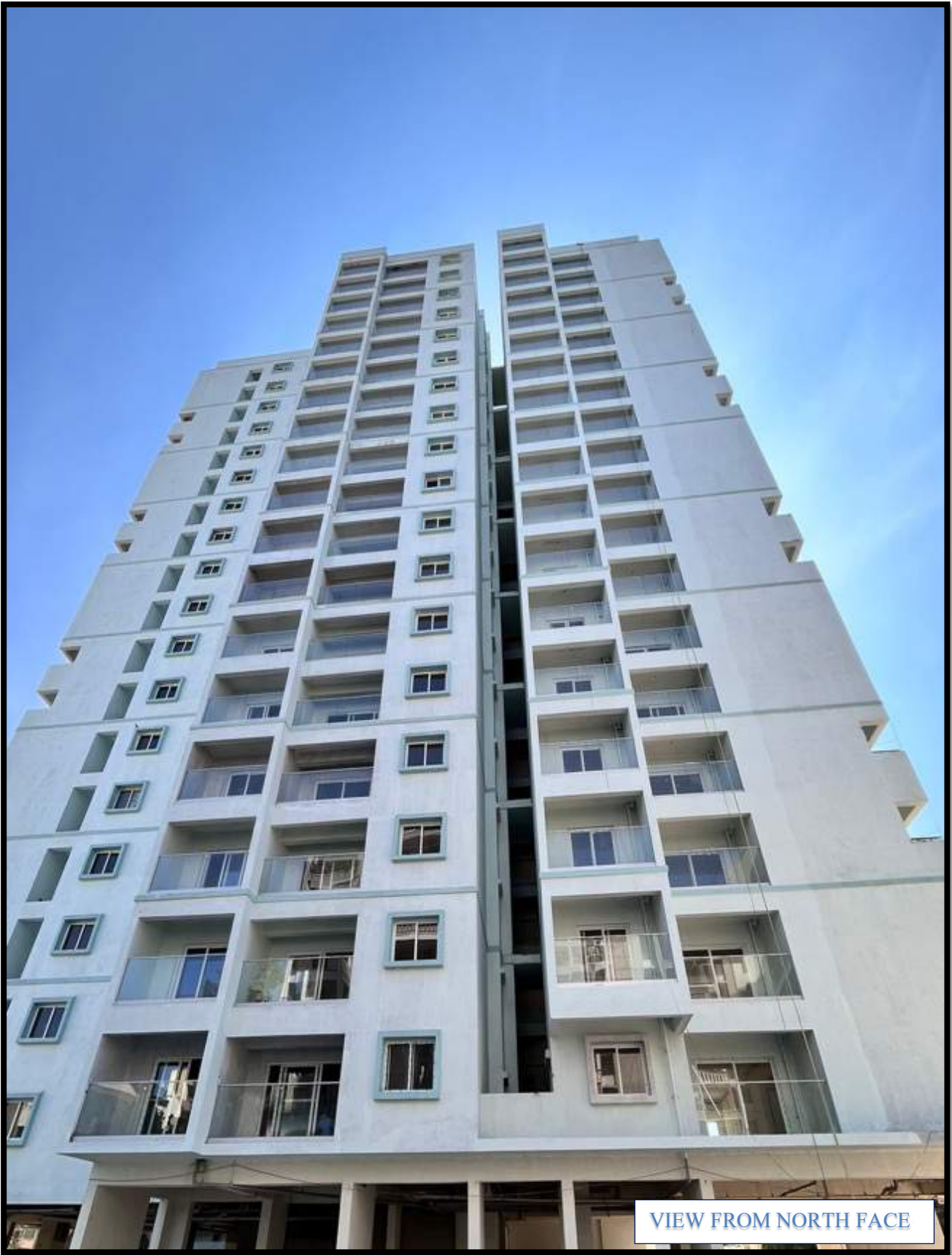
VIEW FROM NORTH FACE