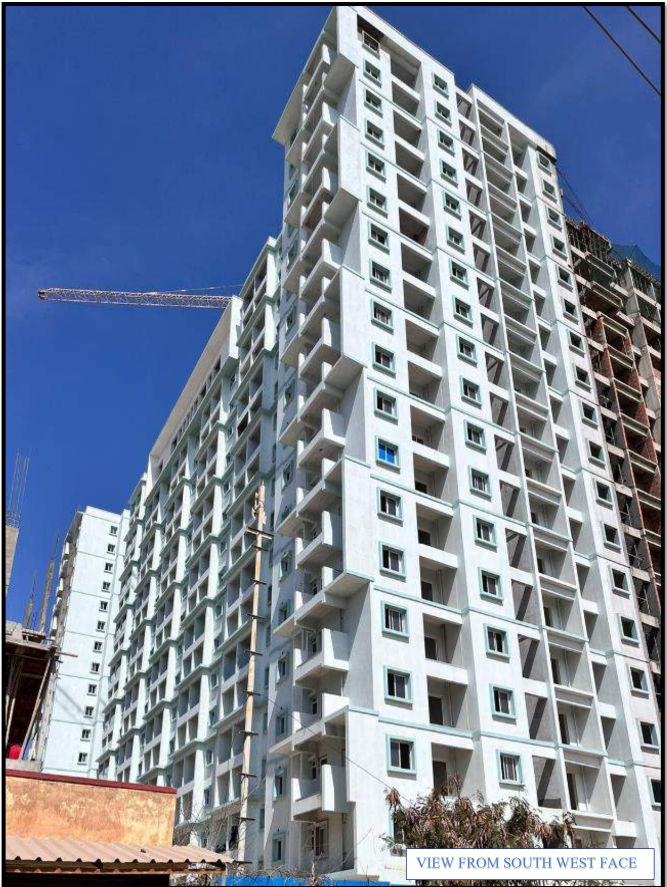
VIEW FROM SOUTH WEST FACE