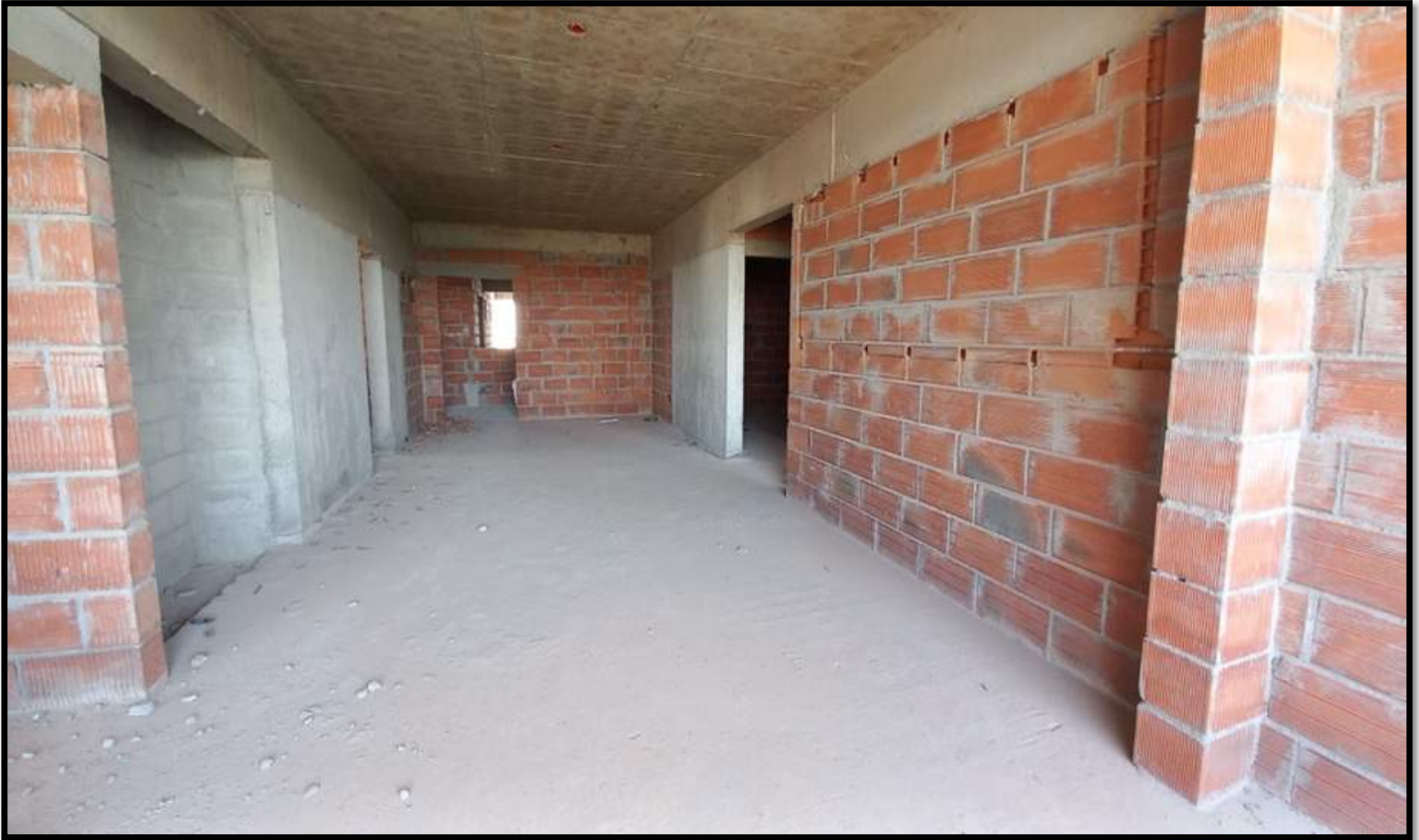
Tower-1 & 2 – Up to 11th floor Block masonry works are completed.