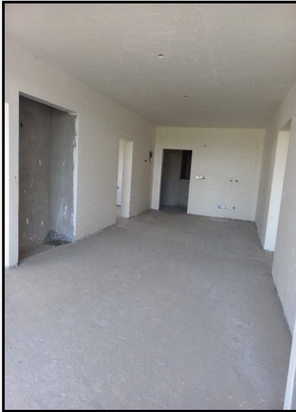
Tower-1 & 2- 7 th floor Internal plastering works are completed.