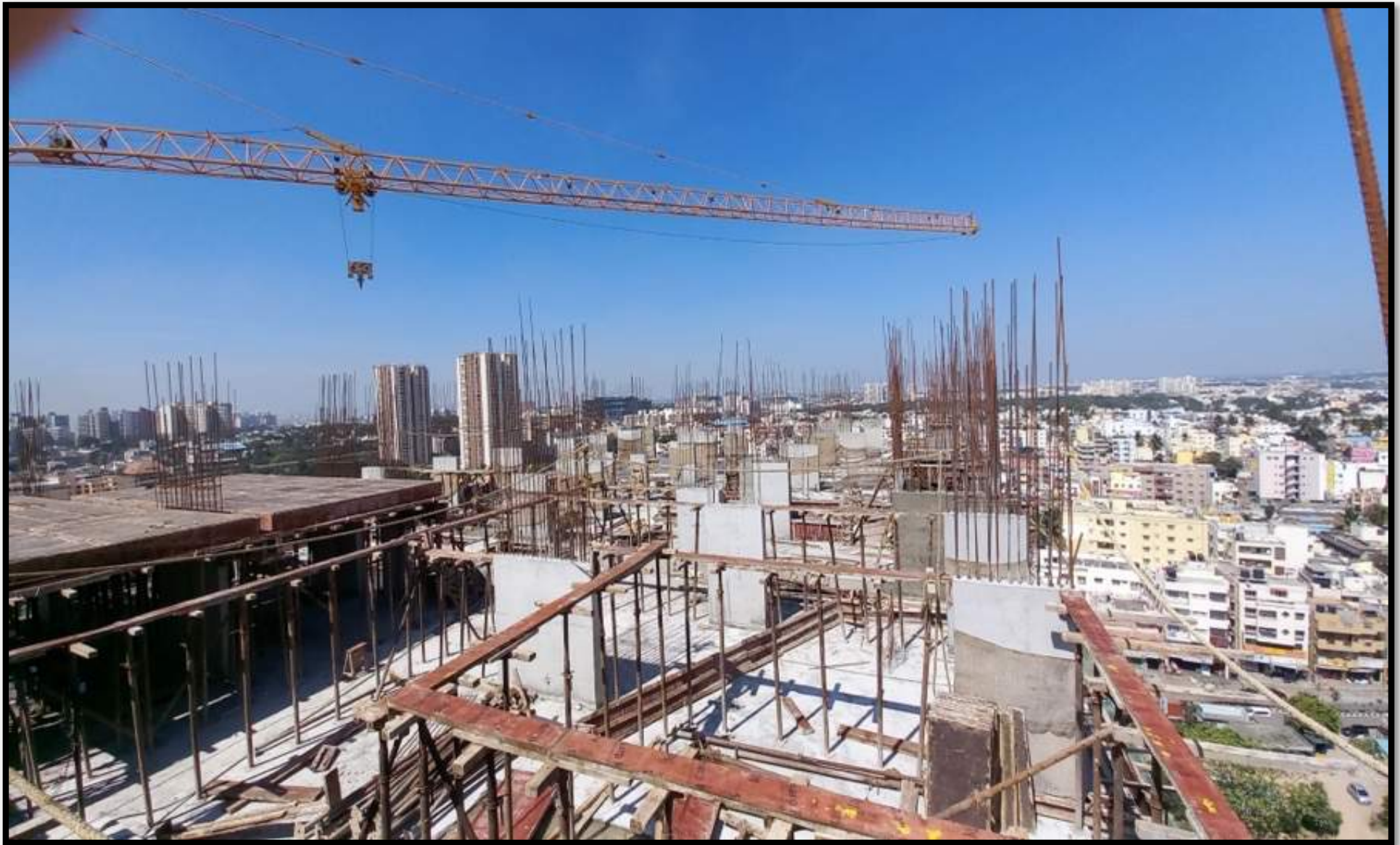
Tower- 2 :18 th floor shuttering works are in progress.