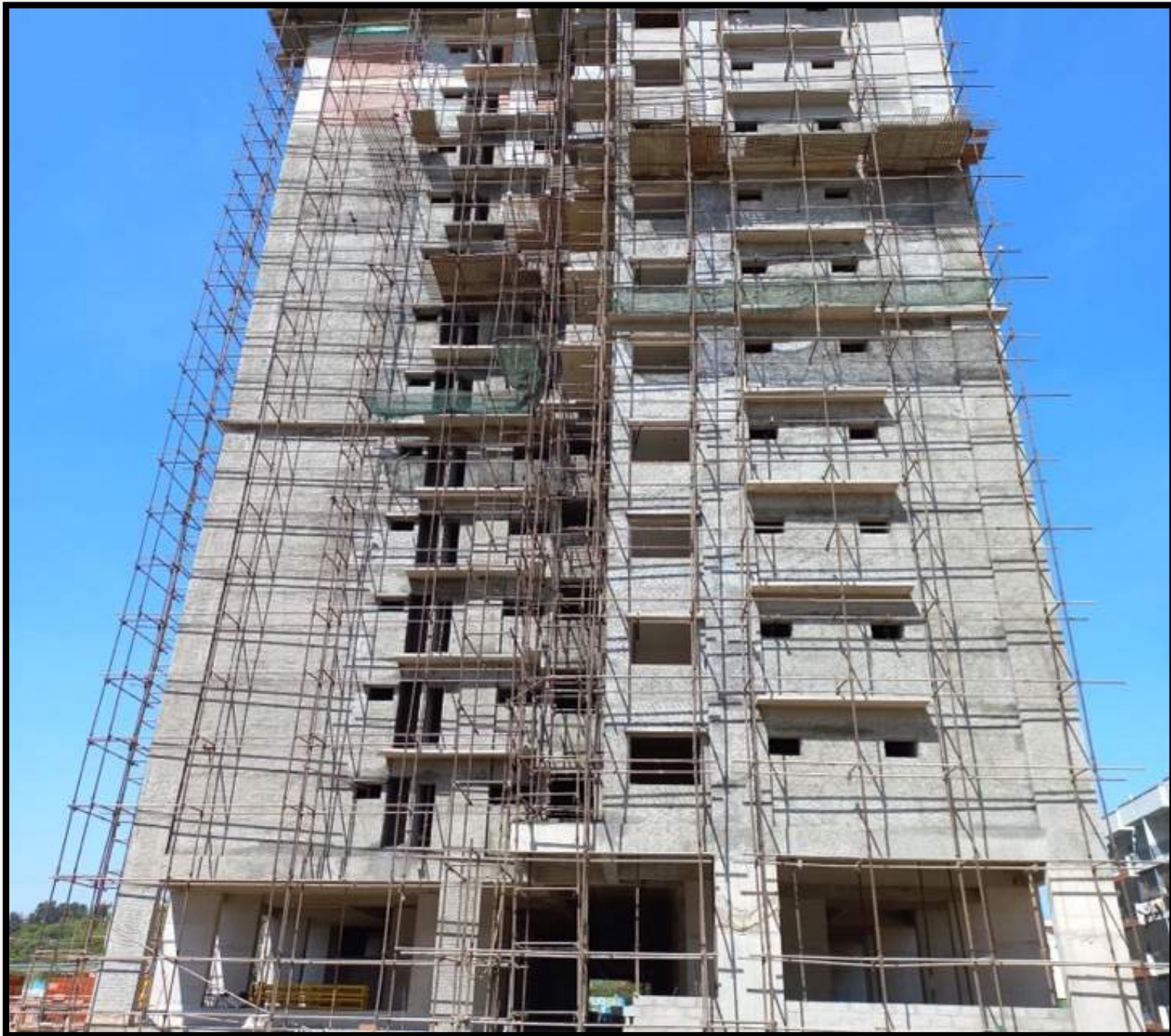
Tower 1 & 2 – External plastering works are in progress.