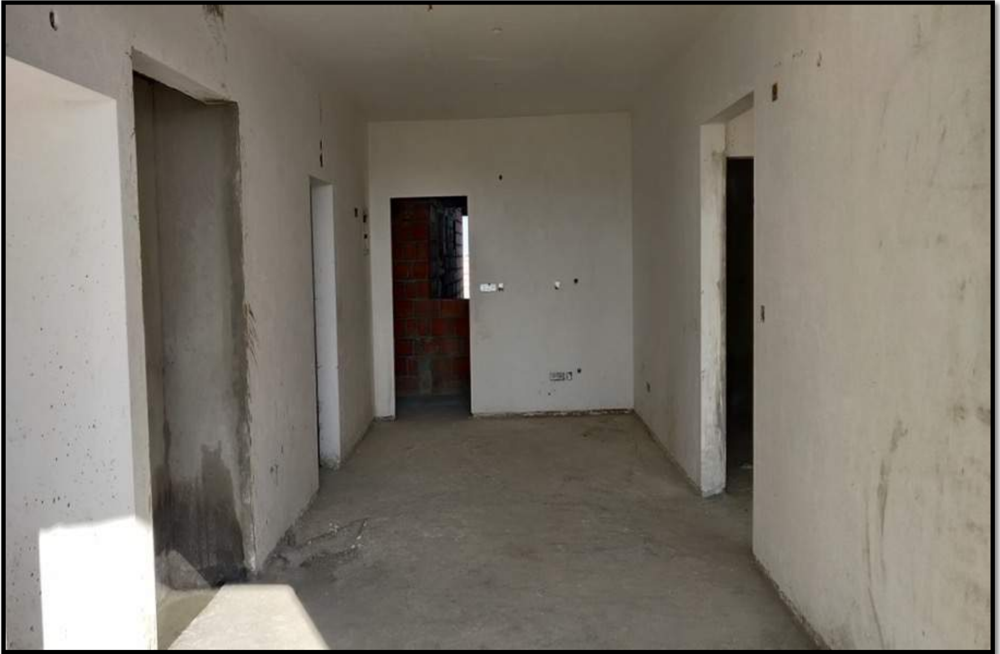
Tower 1 & 2 – 8 th & 9 th floor Internal plastering works are in progress