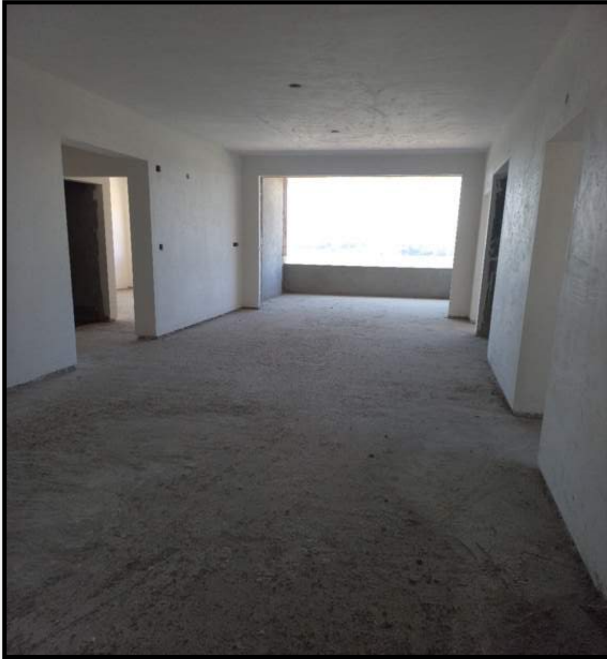
Tower-1&2 – Up to 7 th floor Internal plastering works are completed.