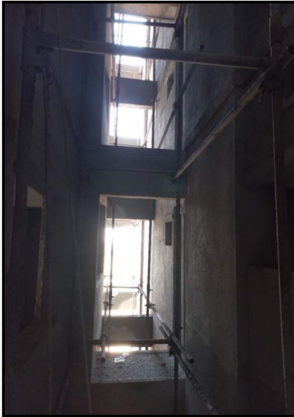
Tower 1 & 2 – External plastering works are in progress.