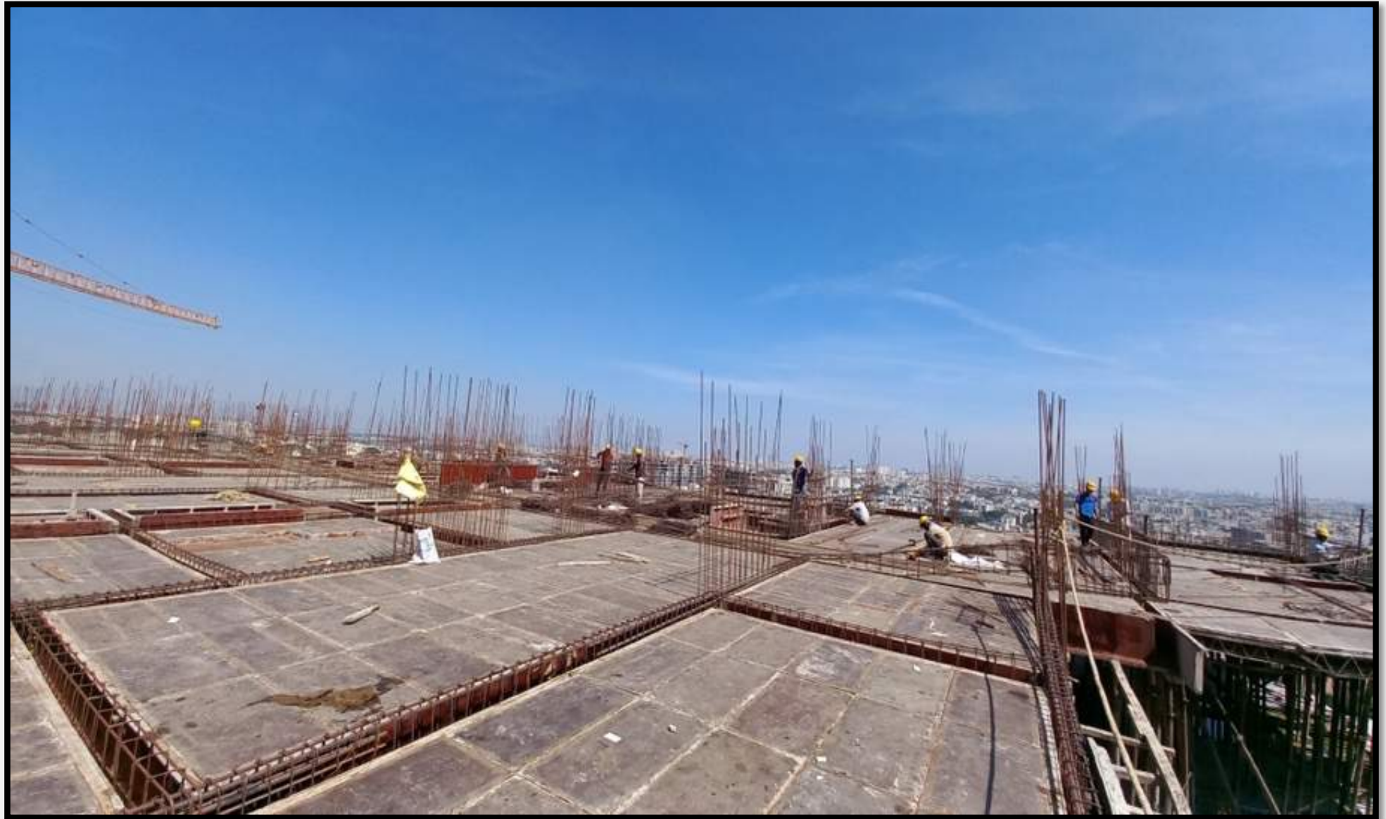
Tower - I : 18 th floor slab reinforcement works are in progress.