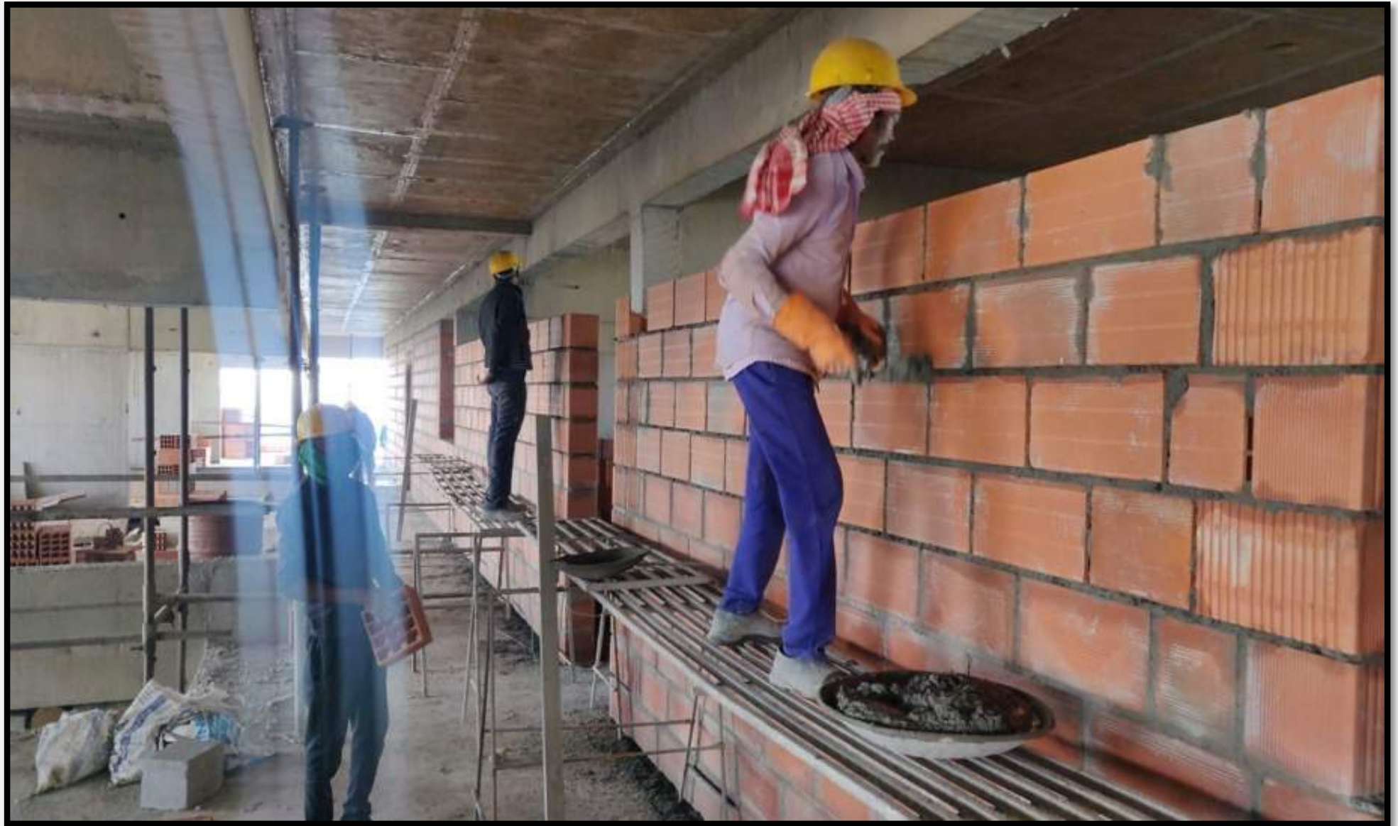
Tower-I – 12 th floor Block masonry works are in progress.