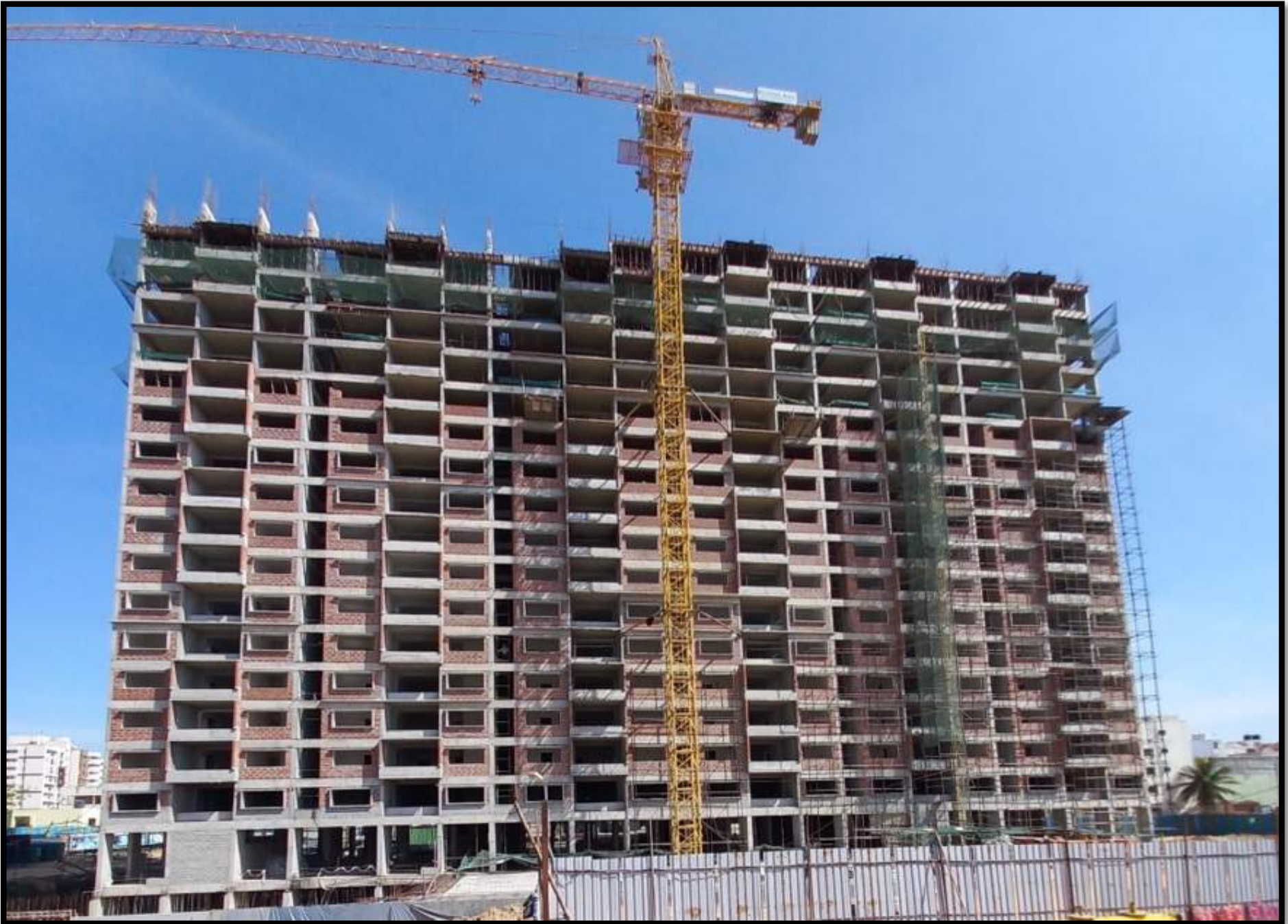
TOWER-01 & 02 VIEW FROM WEST FACE