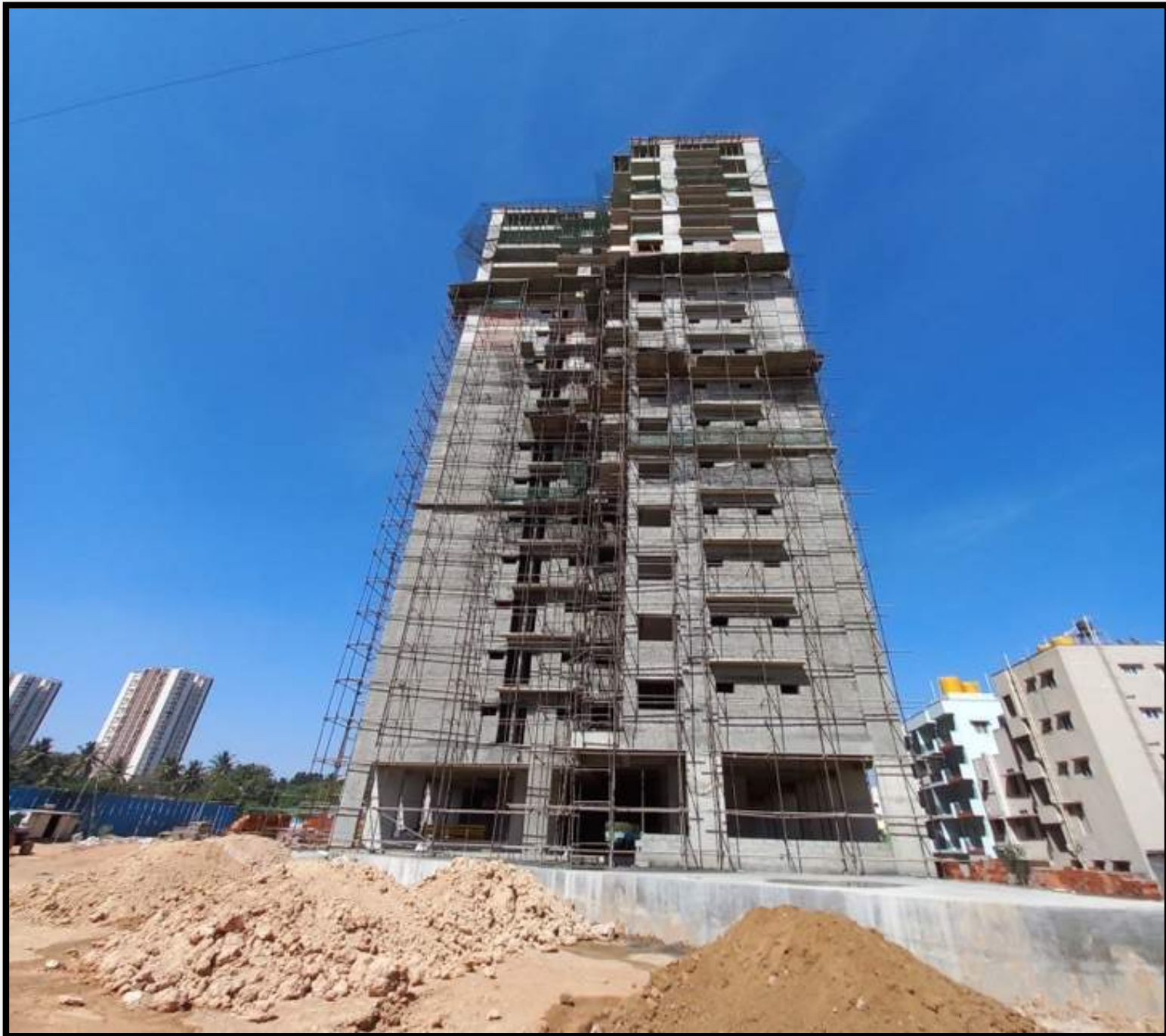
TOWER-01 & 02 VIEW FROM SOUTH FACE