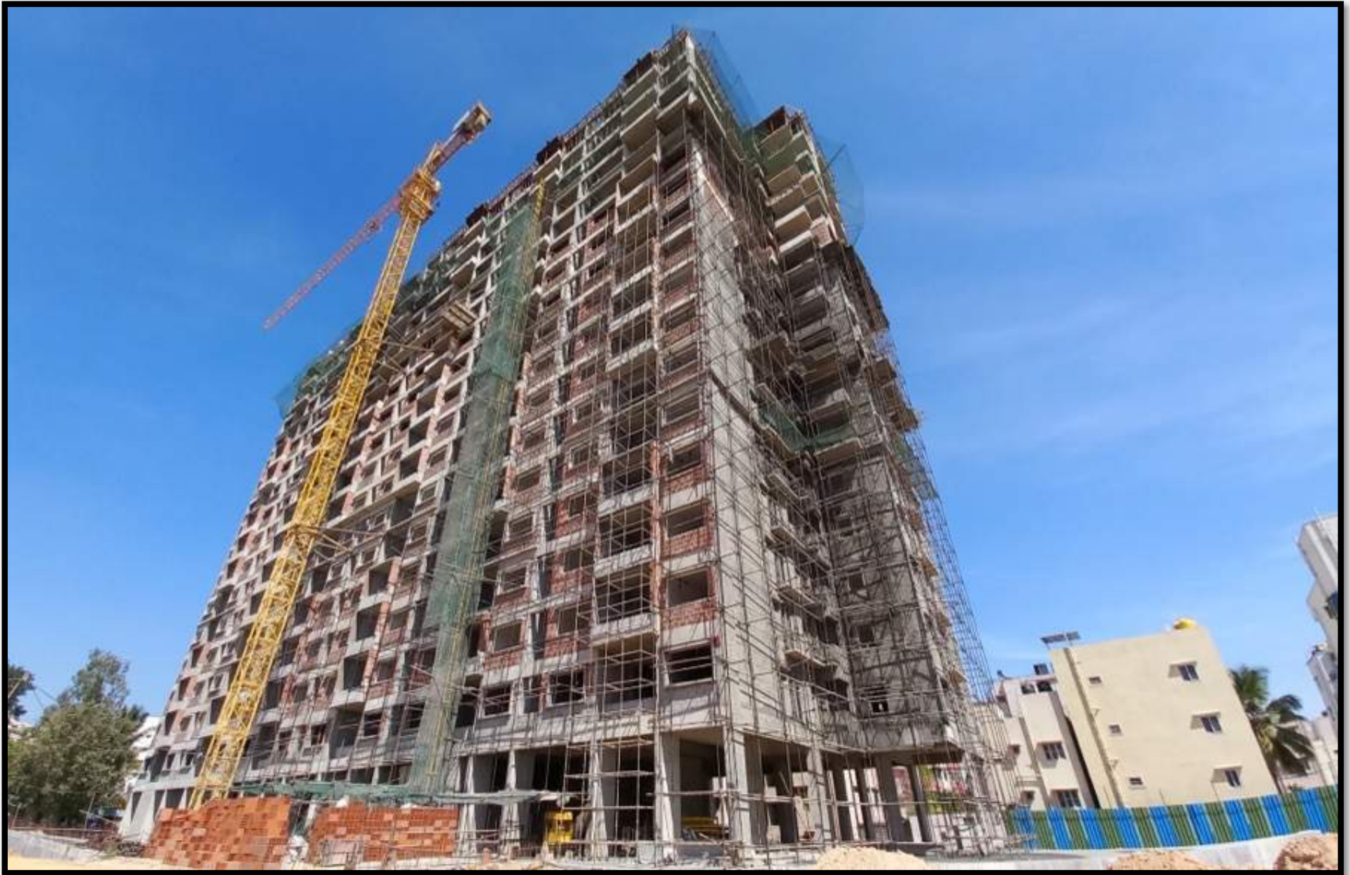
TOWER-01 & 02 VIEW FROM SOUTH WEST FACE