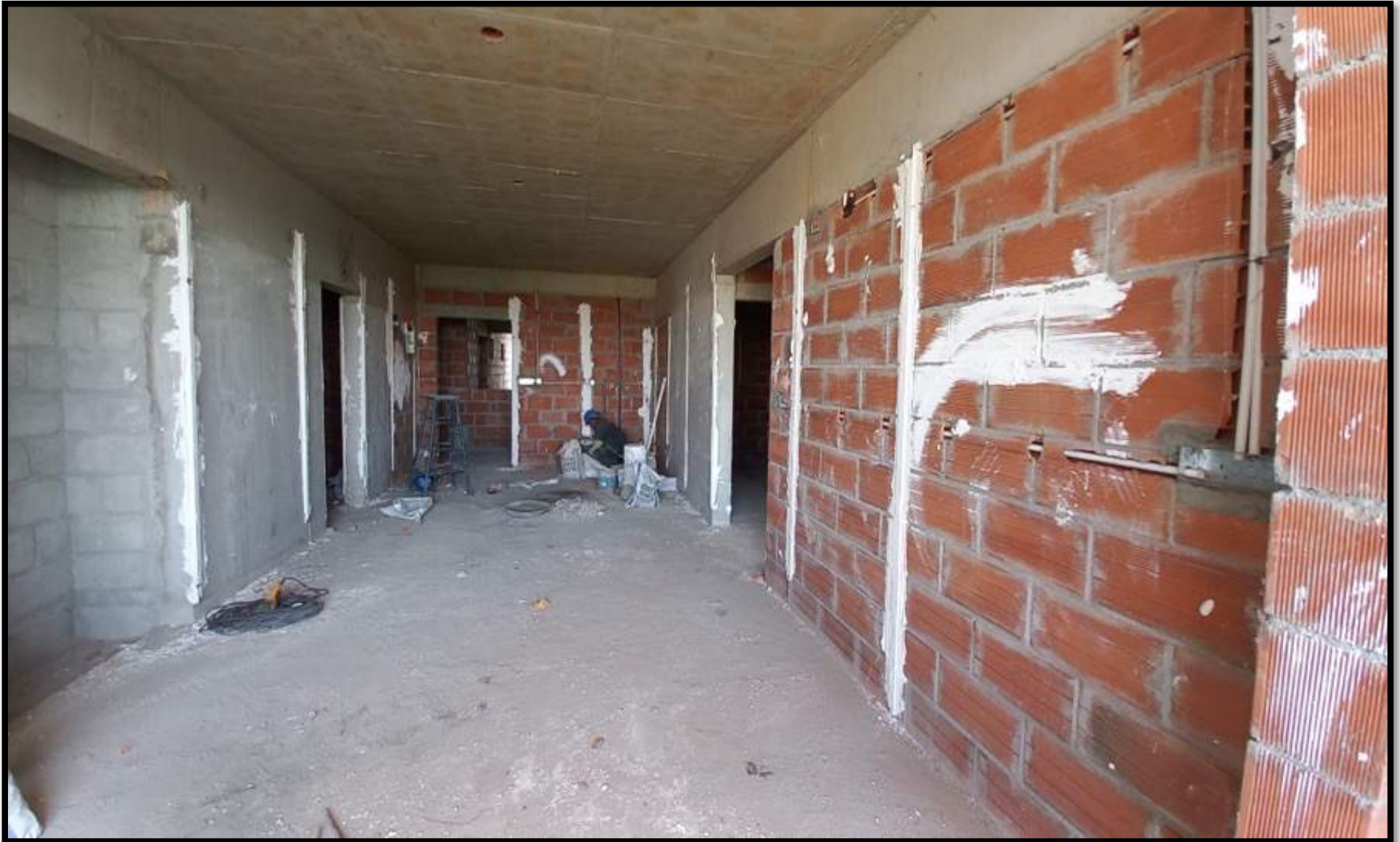
Tower-1 & 2 – 10 th & 11 th floor electrical wall conduiting & GI box fixing works are in progress.